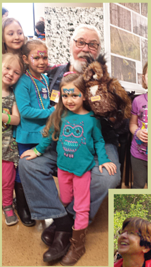
International Festival of Owls