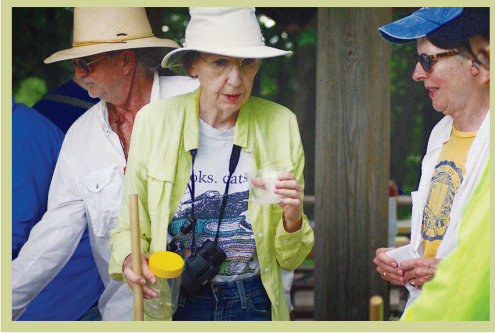
Insect identification class