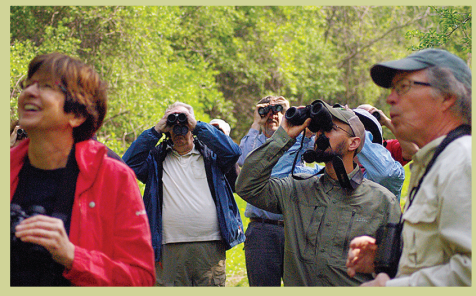
Monthly bird walks at Quarry Hill

Our Volunteers: We couldn't function without our volunteers. Last year they provided over 1,100 hours of their time and expertise. If we had to pay for this time – the cost at just $10 per hour would have been a staggering $11,000!