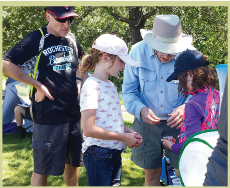
Damsels and Dragons at Chester Woods.

Get the latest program information via our free eNewsletter – send your email address to editor@ZumbroValleyAudubon.org or subscribe online at www.ZumbroValleyAudubon.org .