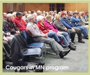
Cougars in MN program

Programs: We hosted a wide variety of well-attended free programs covering topics as diverse as raptors, climate change, cougars, and citizen advocacy. Everyone is welcome to attend and bring a friend!