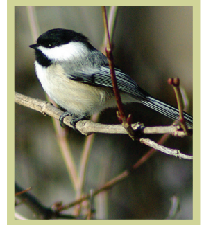
Black-capped Chickadee by Sandy Hokanson