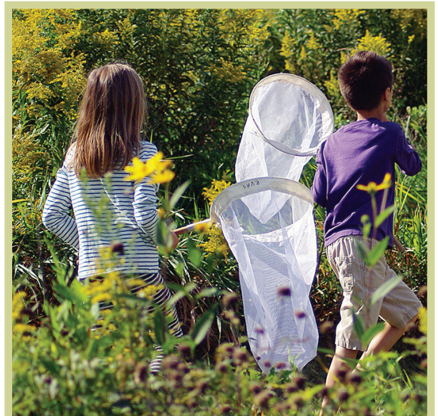
Catching and tagging monarchs at Northern Hills Prairie.