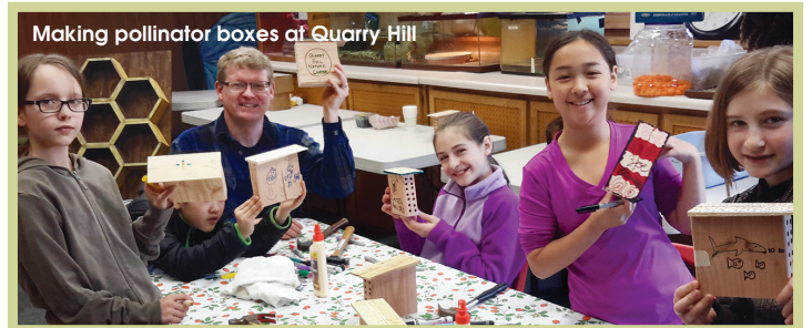
Making pollinator boxes at Quarry Hill

Outreach: Our outreach efforts, especially for a chapter of our size, are extensive: