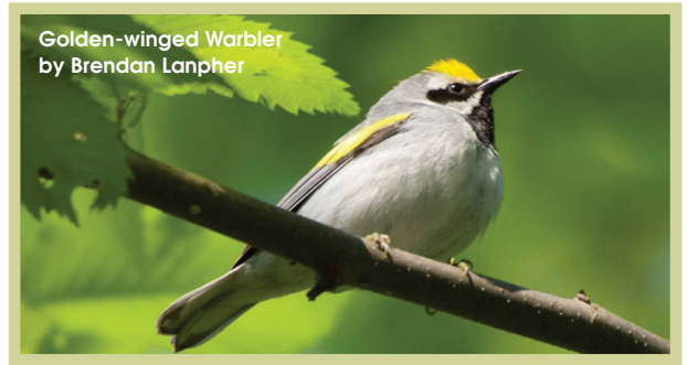
Golden-winged Warbler