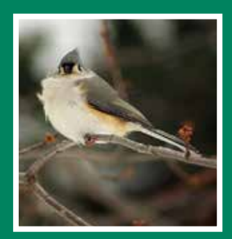
Tufted Titmouse