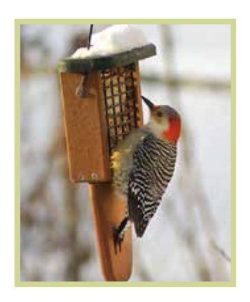
Red-bellied Woodpecker