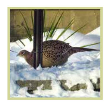
Pheasant by Patty Trncka