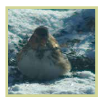
Harris Sparrow