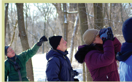
Birders on the monthly bird walk at Quarry Hill.

Be sure to include your name & address so we can verify your membership. All mail-in and email votes must be received by February 20, 2017.