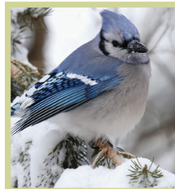
Blue Jay