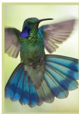
Hummingbird