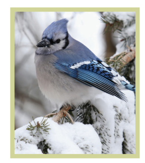
Blue Jay

Each year teams of interested birdwatchers search