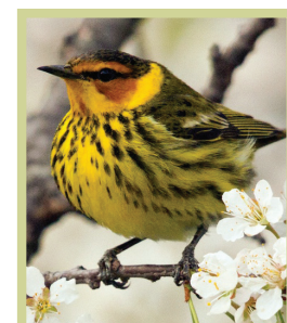
Cape May Warbler by Denise Dupras

Can you help conserve birds and nature just by having a cup of coffee? Yes, if it's the right kind of coffee! Migratory birds that spend the winter in the tropics will thank you for