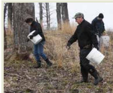
Top: Bird banding in Guatemala. Above: Seeding native plants at a new local park called "Prairie Crossings". Below: Big Birding Day at Chester Woods.